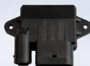
Glow Plug Controller