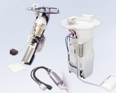
Fuel Pump & Module