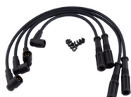
Ignition Cable Set