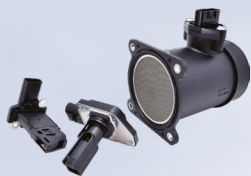
Air Flow Sensor